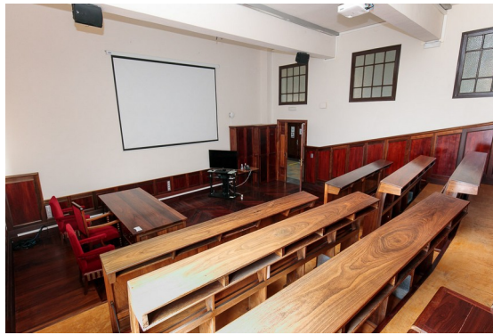
Sala Polivalente: Original classroom in the Central Building, restored and dedicated to solemn academic events and ceremonies (PhD Dissertations, Conferences, etc) .