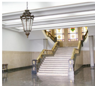
Main stairs to 1 st Floor